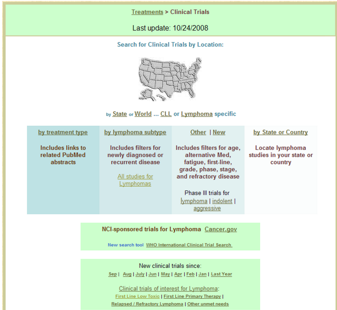
Figure 4: Patients Against Lymphoma resource – providing ready-to-use queries of ClinicalTrials.gov

Here is a screenshot of our clinical trials resource, which illustrates that we have direct experience in assisting patients with study searches. On this page and sub-pages we provide ready-made queries of the ClinicalTrials.gov registry to help patients find studies specific to their condition.